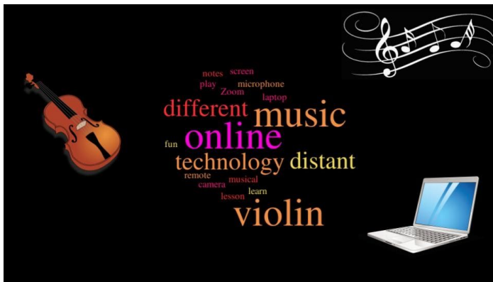
This is a word cloud about having online music lessons