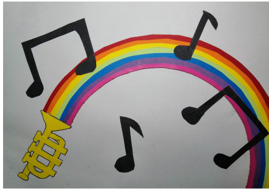
This is a collage about enjoying making music in lockdown

How could you represent this through art? Here are some examples to inspire you.