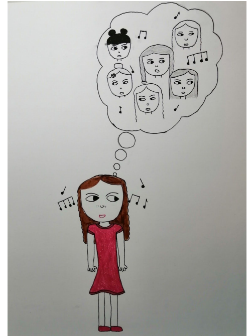
This is a drawing of someone enjoying singing by themselves but missing singing with a choir